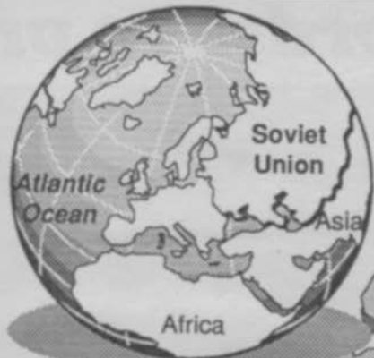
An alien's-eye view of Russia